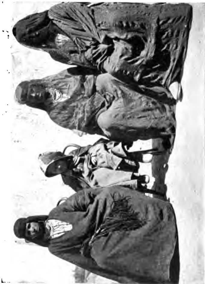
IN THE HAREM